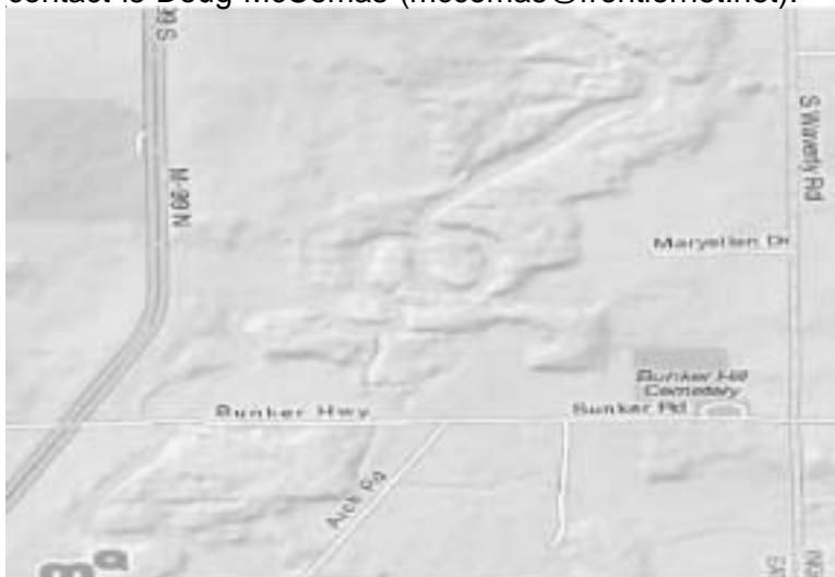
Robbins United Methodist Church