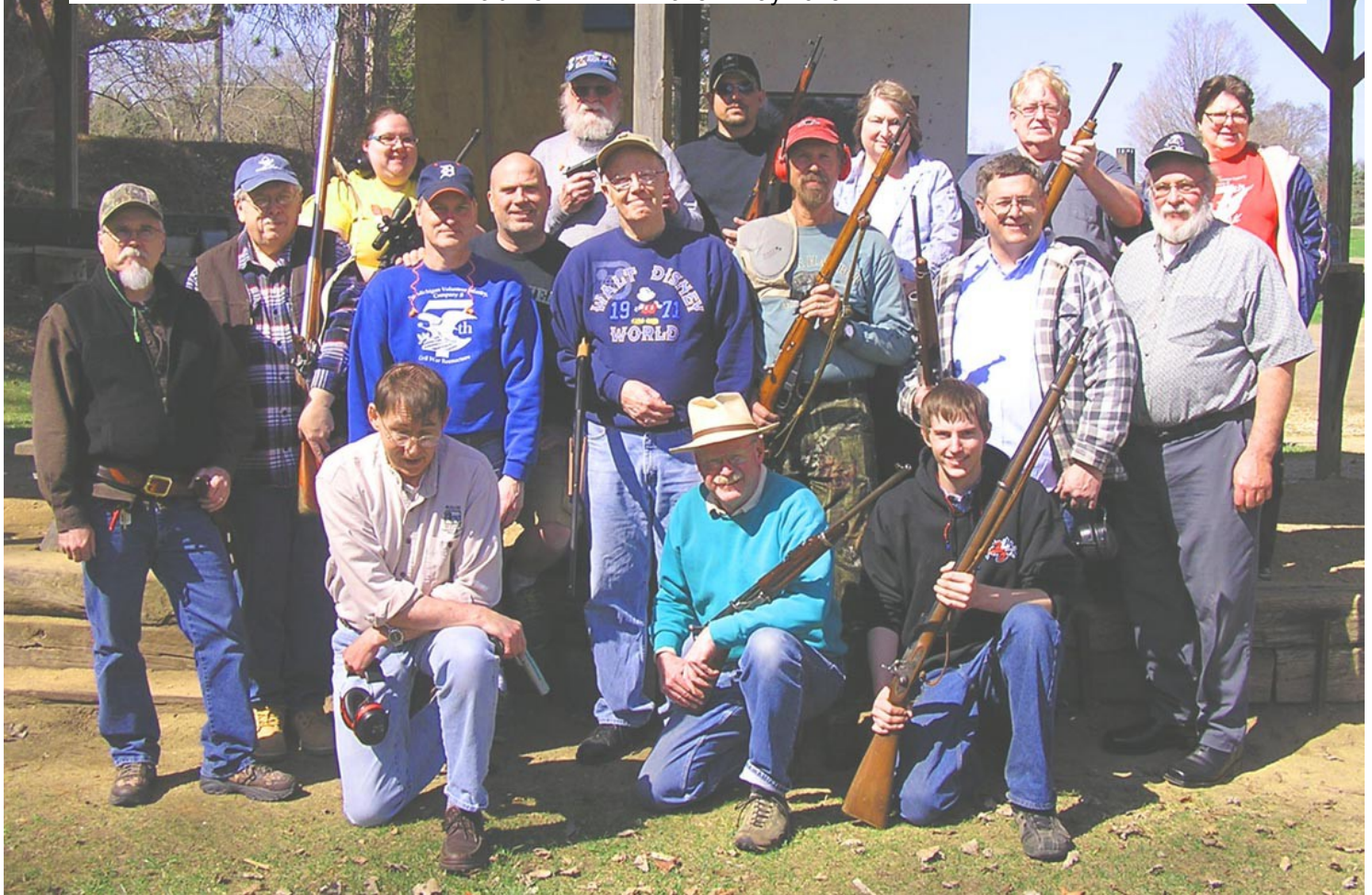
Part of the group present at Eaton Rapids Conservation Club on April 18, 2015, for the 2 nd Annual Charlie Colegrove Memorial Live Shoot.