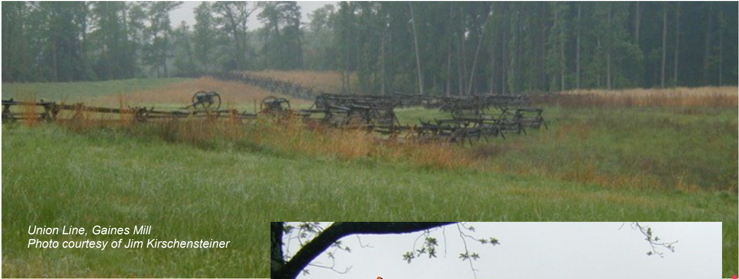
Union Line, Gaines Mill

The Seven Days Battles were a series of six major battles over the seven days from June 25 to July 1, 1862, near Richmond, Virginia. Third in the series was the battle for Gaines Mill, on June 27. By the night of the 27 th , the Union Army had retreated to Harrison's Landing. Gaines's Mill and the Union retreat across the Chickahominy was a psychological victory for the Confederacy, signaling that Richmond was out of danger. [ The Seven Days Battles signaled the end of the Peninsula Campaign. The Army of the Potomac encamped around Berkeley Plantation, birthplace of William Henry Harrison.