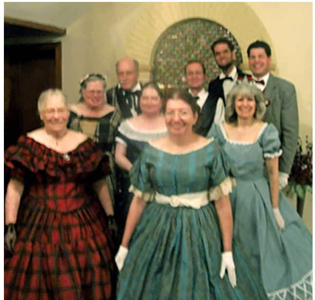
7 th Michigan participants at the Coldwater Ball, which took place on April 26.

Flap Jack: 1601 S Waverly Rd, Lansing, MI 48917