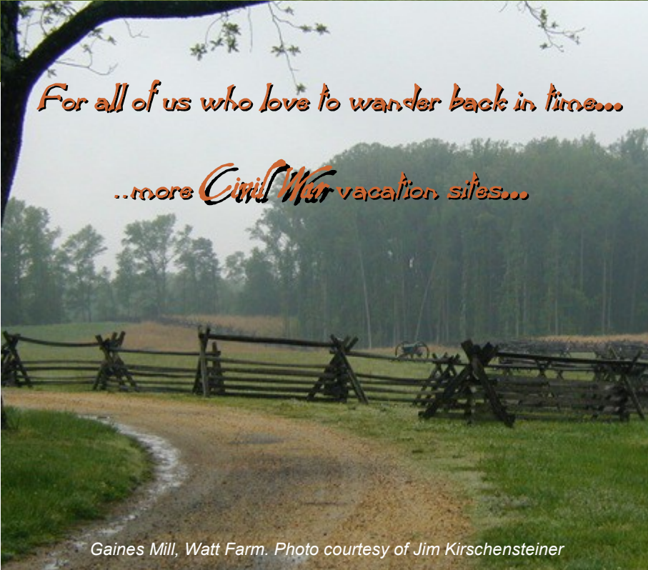
Gaines Mill, Watt Farm.

The Seven Days Battles were a series of six major battles over the seven days from June 25 to July 1, 1862, near Richmond, Virginia. Third in the series was the battle for Gaines Mill, on June 27. By the night of the 27 th , the Union Army had retreated to Harrison's Landing. Gaines's Mill and the Union retreat across the Chickahominy was a psychological victory for the Confederacy, signaling that Richmond was out of danger. [ The Seven Days Battles signaled the end of the Peninsula Campaign. The Army of the Potomac encamped around Berkeley Plantation, birthplace of William Henry Harrison.