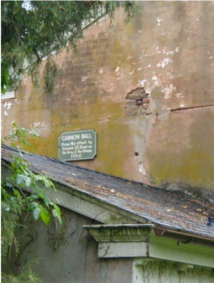
Left: Berkley Plantation at Harrison's Landing. Right: Confederate cannon ball in wall of Berkley Plantation.