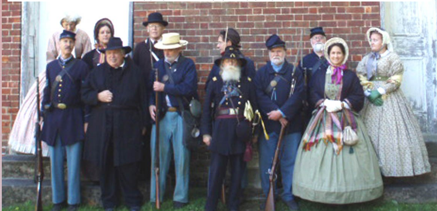
7 th Michigan Group: Stafford Co., Falmouth, Virginia - September 19, 2009