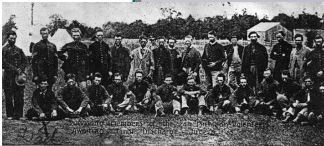
Photo of the 24th Michigan at Camp Butler awaiting discharge.

At this time we have 2 School programs planned. First is May 8, 2015 Birney Middle School in Southfield, 1 to 3. We will make carpool arraignments. Second Ovid Middle School, Ovid 1 to 3 again we will try to carpool. We need both military and civilian presenters for both programs.