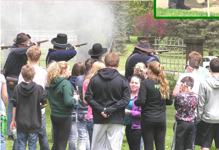
Soldiers' volley – student day, Fri. May 20.