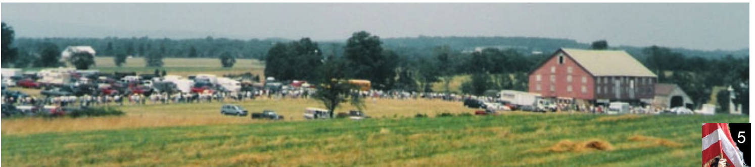
Registration line at 135 th Gettysburg, July 1998. The red barn is the same one featured in the TNT motion picture, "Gettysburg," in 1992.

Altogether, it was a great and unforgettable experience. We provided the public with good information and context about the unit, the battle, and the war; we taught each other a few things with the help of several experts in the group; and we thoroughly appreciated the opportunity to reflect and remember the terrible and momentous events that occurred there just shy of 150 years ago.