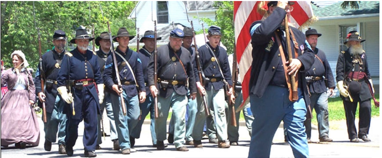
Rose Parade 2011