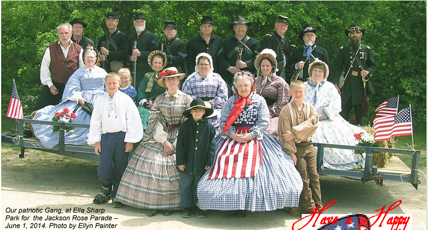
Our patriotic Gang, at Ella Sharp Park for the Jackson Rose Parade – June 1, 2014.