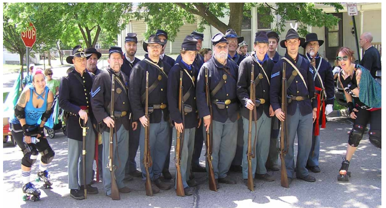
The Rose Parade was June 3.