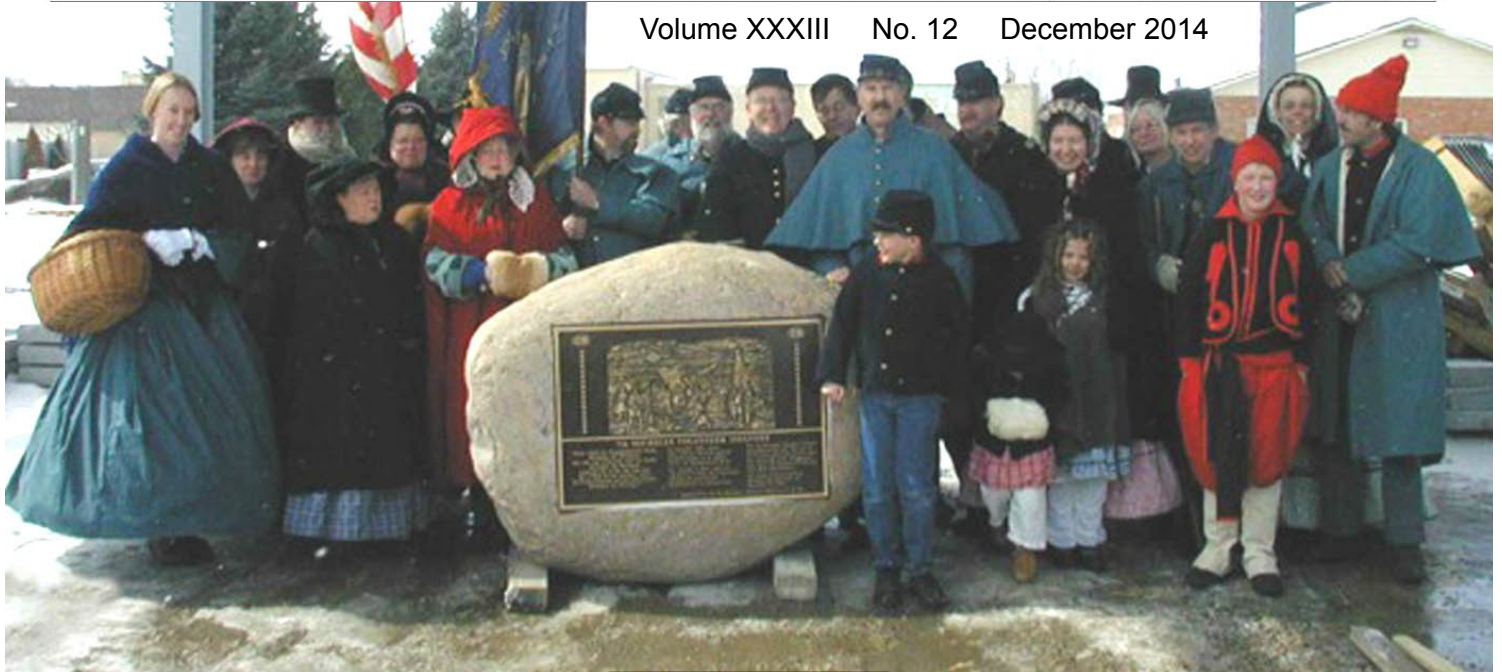
Members of the 7 th MI, Co. B, in Durand, MI, in the winter of 2002- 2003. We are pictured with our new monument, which later in 2003 was transported to its present home on the banks of the Rappahannock River in Fredericksburg, VA. It was dedicated in September of that year, and commemorates the crossing of the Rappahannock by 7 th Michigan troops during the battle of Fredericksburg, Dec. 11-15, 1862.