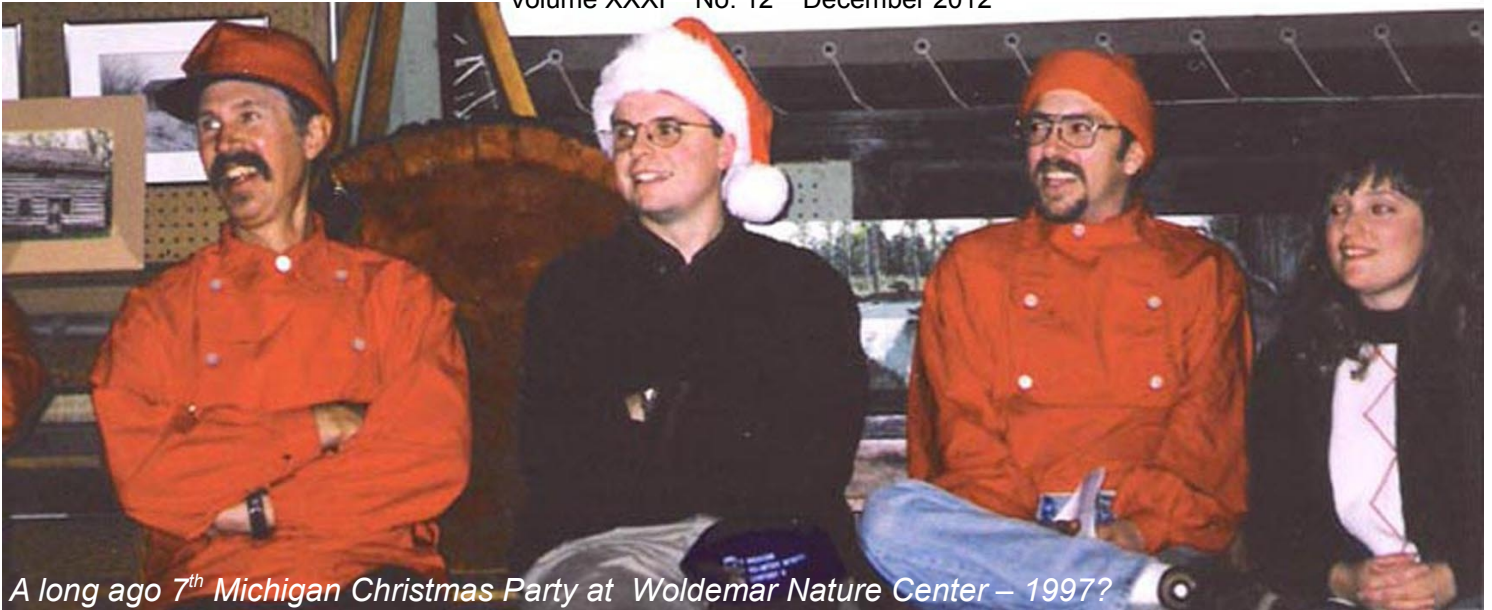
A long ago 7 th Michigan Christmas Party at Woldemar Nature Center – 1997?