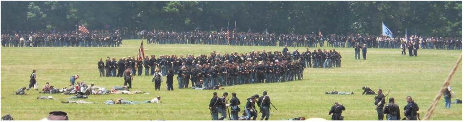
150 th Gettysburg – July 4-7, 2013 -Gettysburg, PA