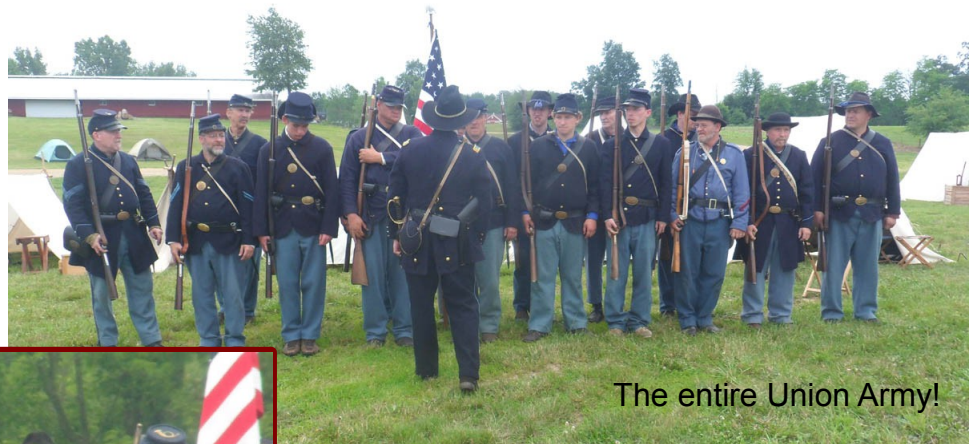
The entire Union Army!