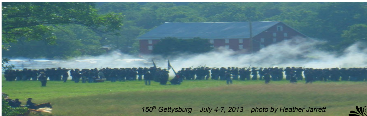
150 th Gettysburg – July 4-7, 2013

The Michigan Civil War Sesquicentennial History Partners is composed of over 1,000 Civil War reenactors and living history historians; patriotic and hereditary organizations; scholars and educators, roundtables; local and statewide libraries, historical societies, genealogical societies; local and statewide museums; and numerous local Michigan communities that sponsor special and annual historical programs related to the Civil War. Each year the History Partners hosts the annual Reenactors' Conference and creates a Statewide Reenactors' Events Calendar to commemorate the Michigan's role in Civil War.