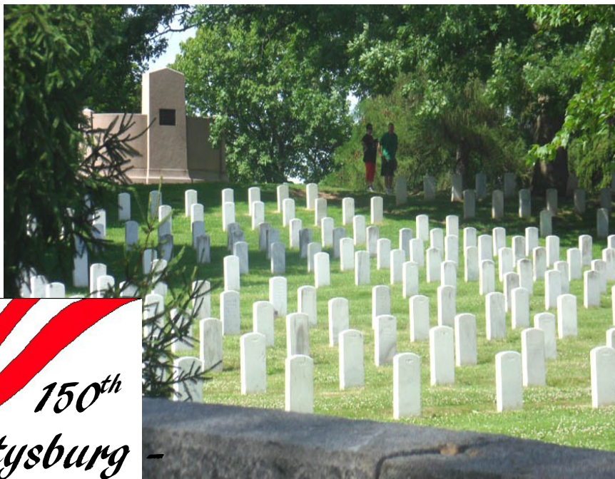
Gettysburg National Cemetery