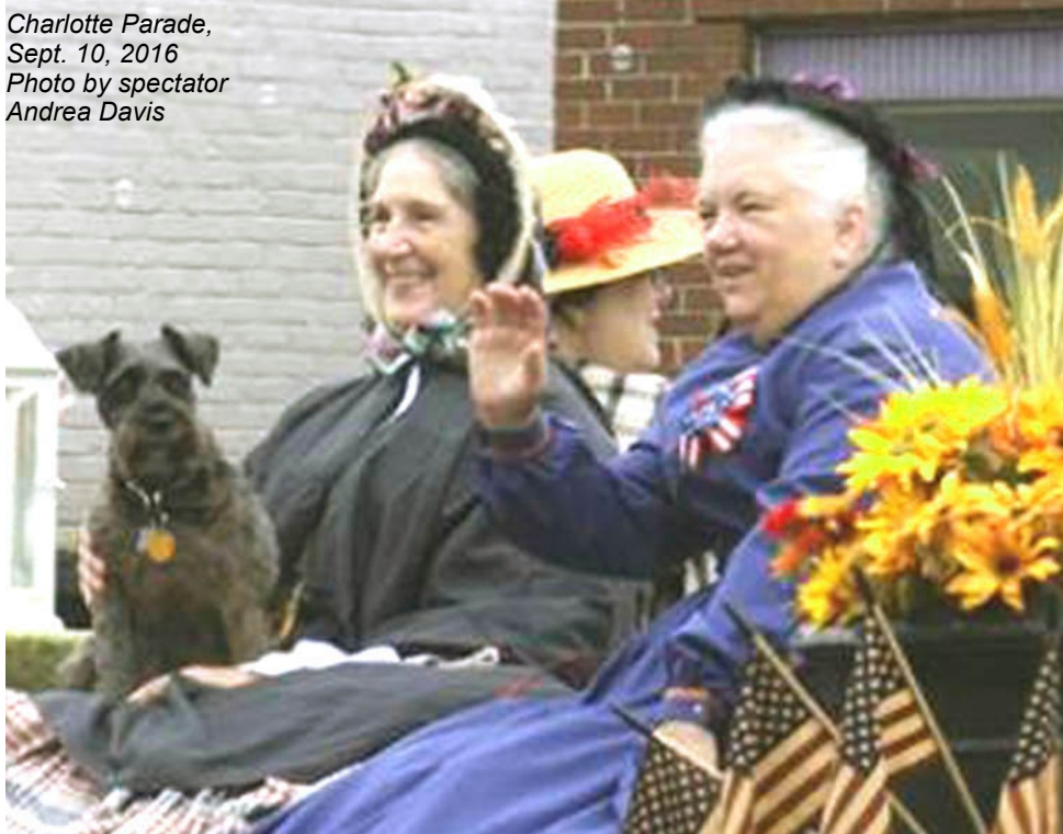
Charlotte Parade, Sept. 10, 2016