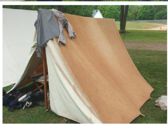
Our guys in camp, and at left, a closeup of the famous "tanned" tent.

"A copy of the minutes of previous club meetings is available upon request to all members in good standing."