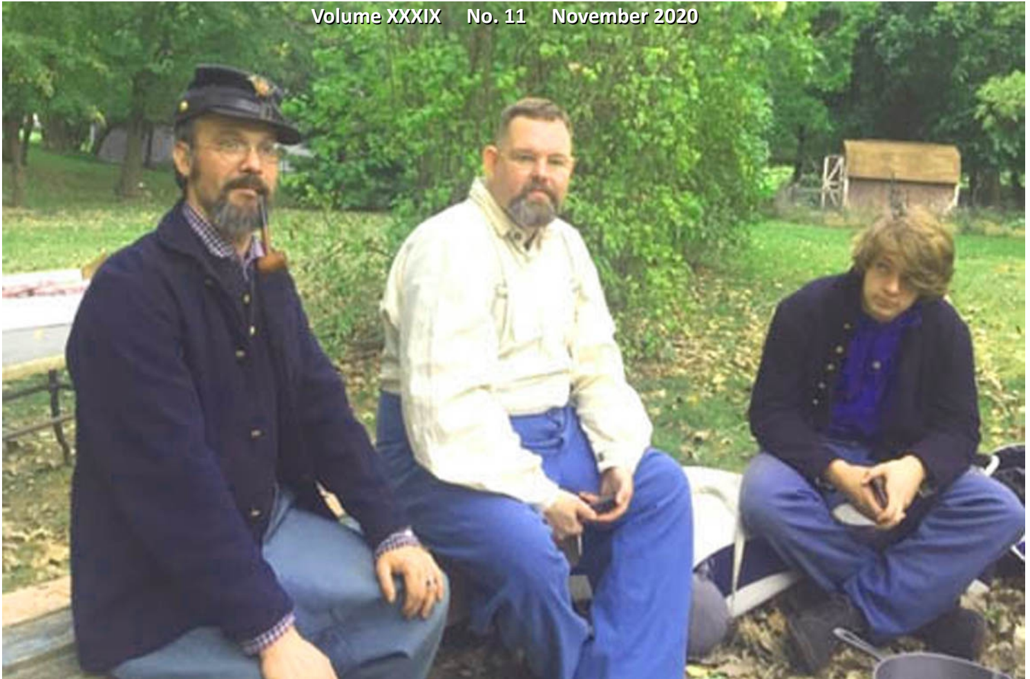
Weekend warriors at "McComas Meadow" mini-muster, Oct. 3-4, 2020.