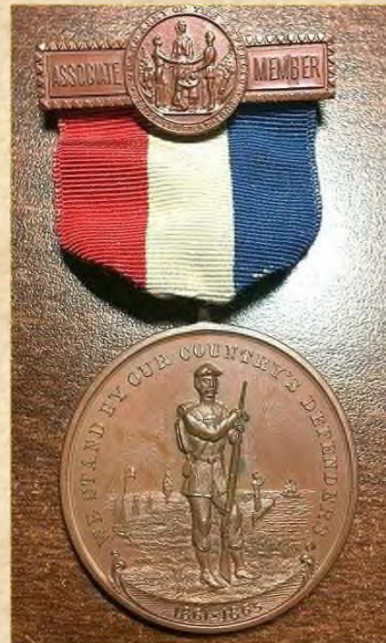
G.A.R. Associate Membership Badge