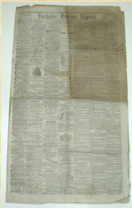
Rochester Evening Express 4/19/1861

The Tent existed from 1918 - 2013. It was based in Corunna and later moved to Lansing, Michigan before it folded.