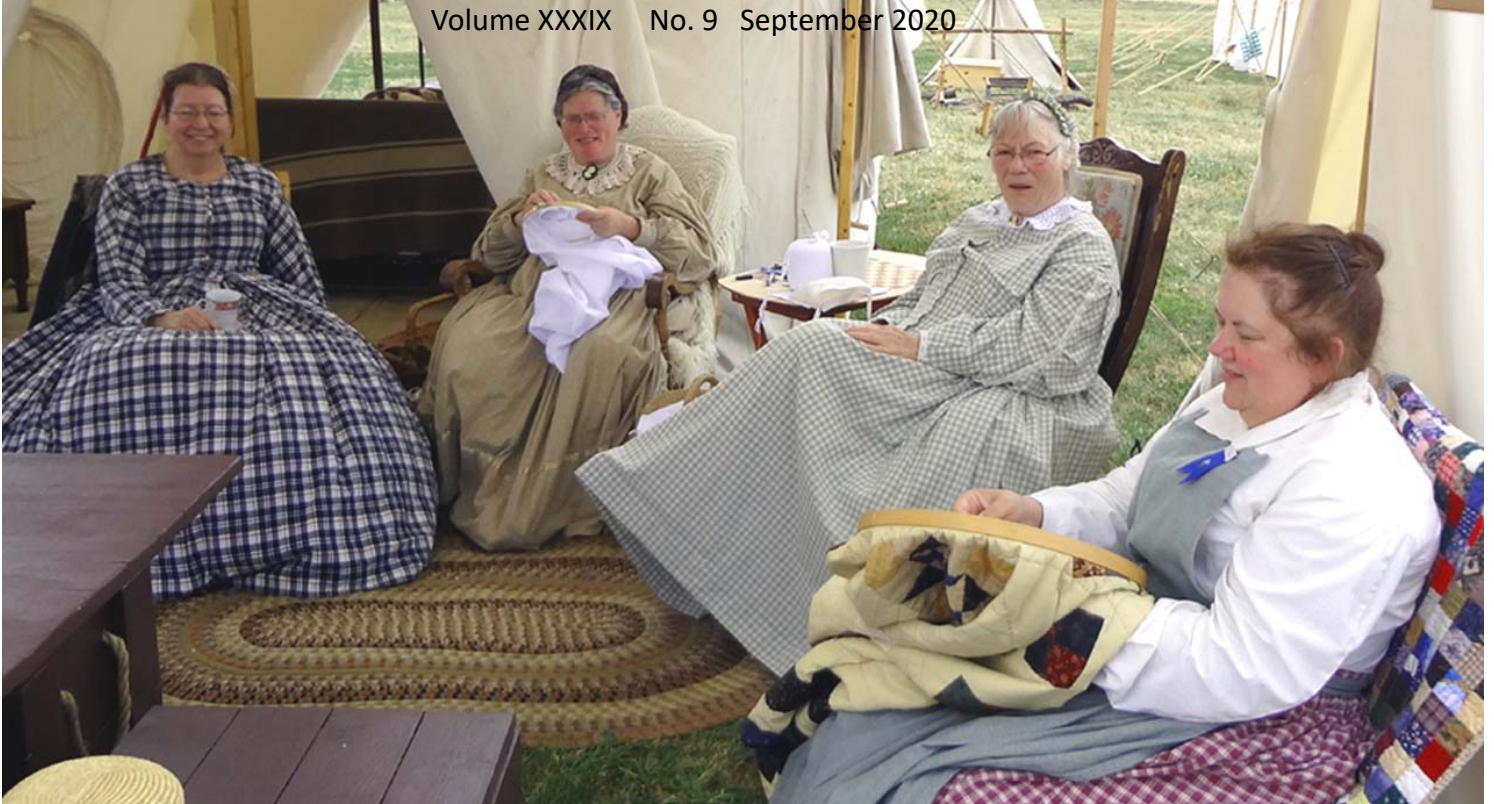
Some of our 7 th Michigan ladies at Turkeyville, June, ? year?