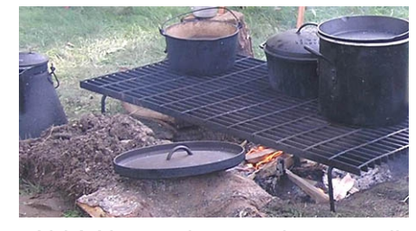
Ahh! Almost time again to smell the woodsmoke and love that REAL food!

Our Next Key Effort Event: Greenfield Village Civil War Remembrance Memorial Day Weekend May 25 – 27, 2019